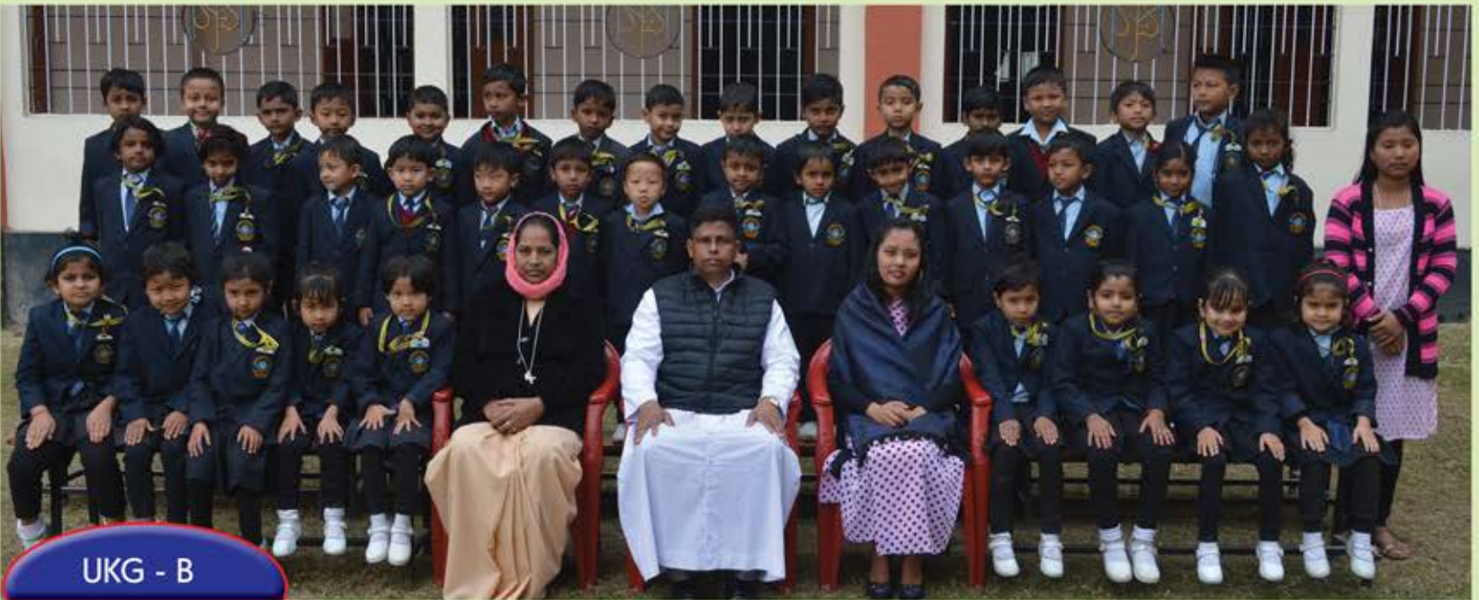
UKG - B