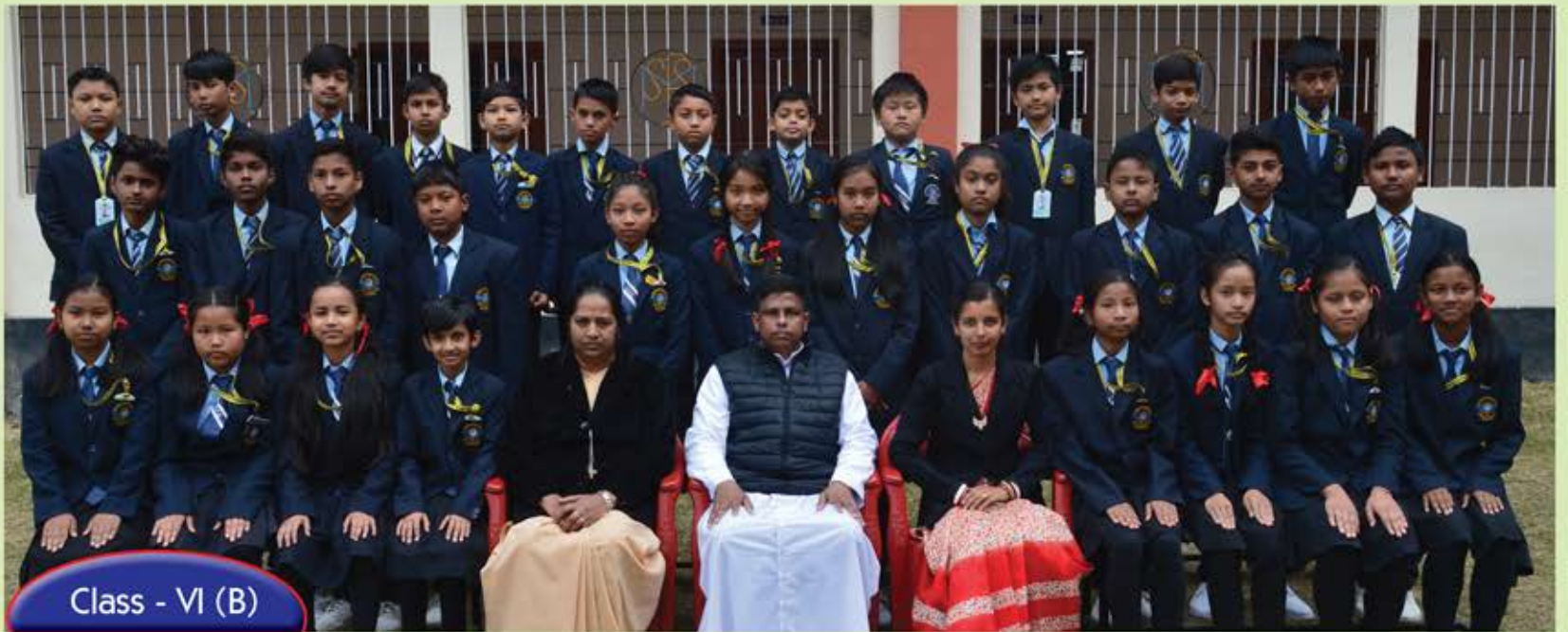
Class - VI (B)