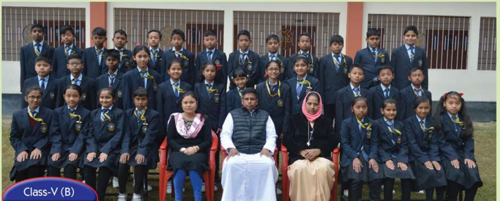
Class - V (B)