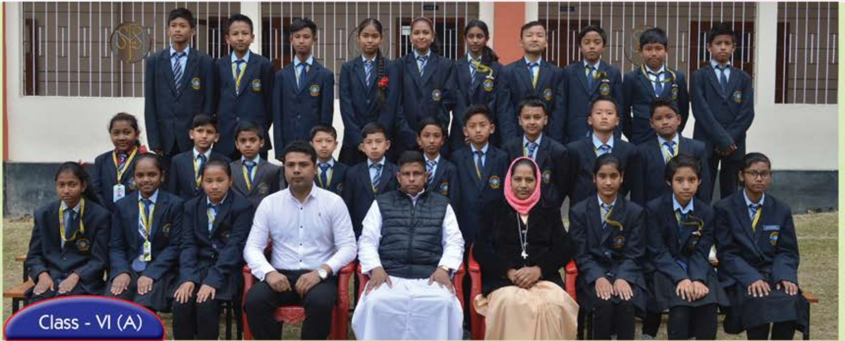
Class - VI (A)