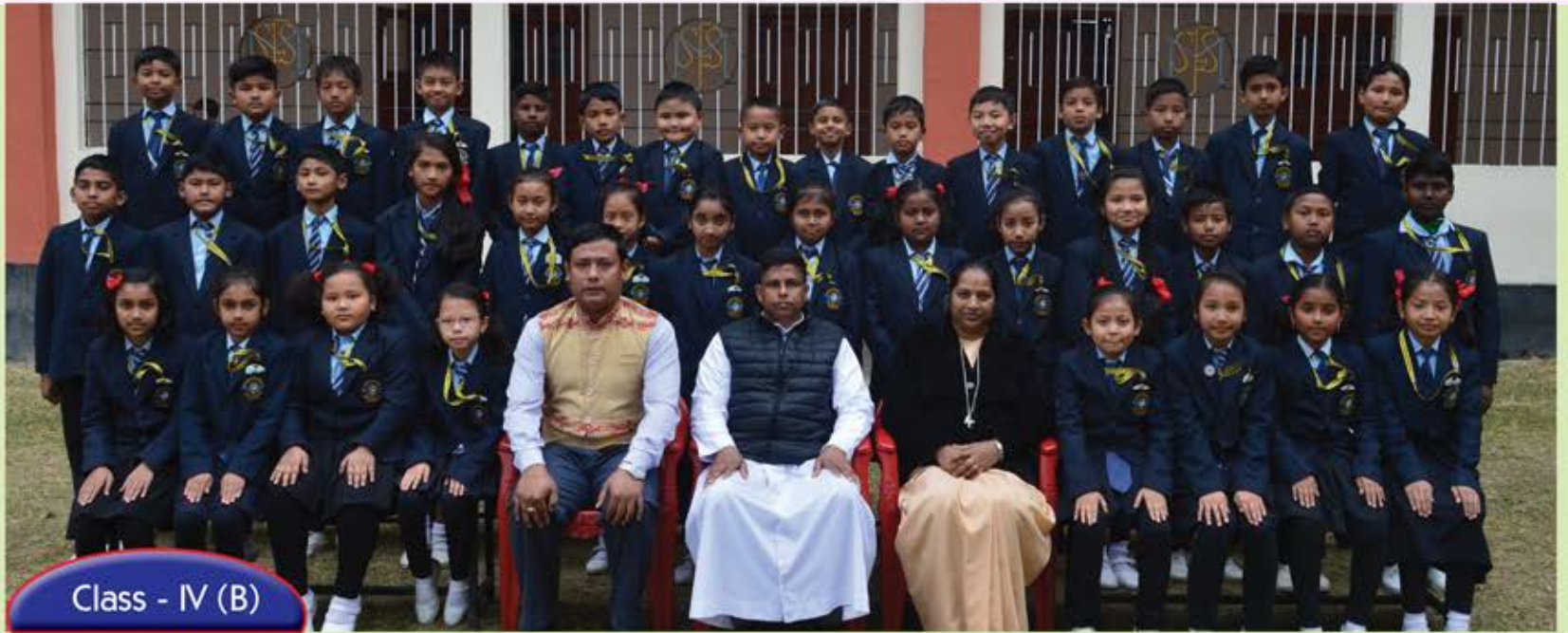
Class - IV (B)