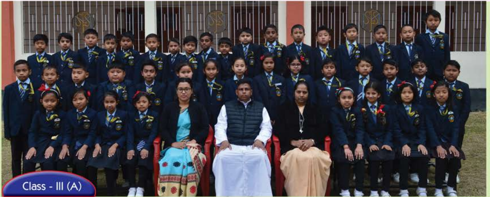
Class - III (A)