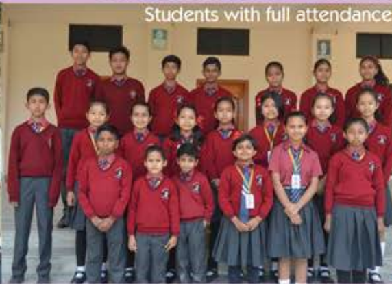
Students with full attendance