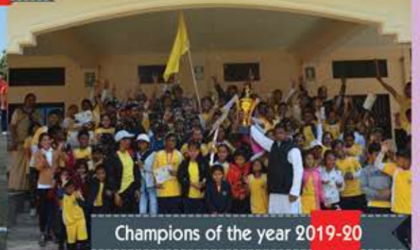
Champions of the year 2019-20