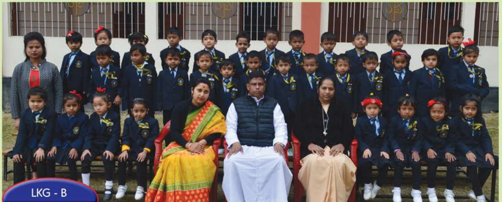
LKG - B