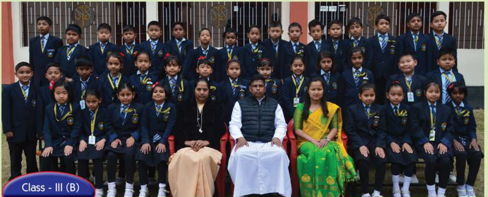
Class - III (B)