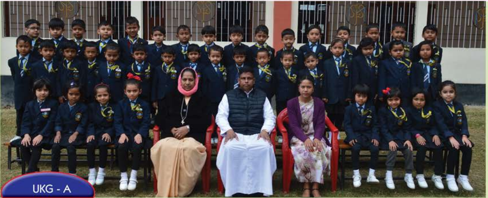
UKG - A