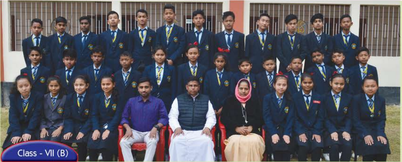
Class - VII (B)