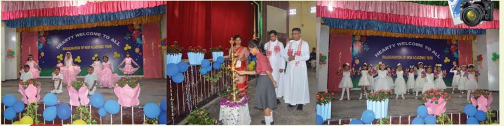
Inauguration of Academic Year 2019-20