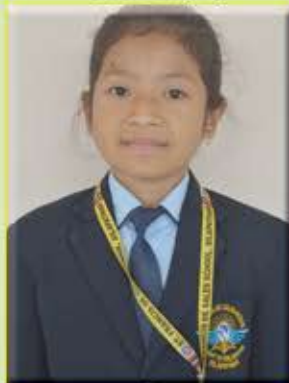
Srishti Kuli Class - IV (B)