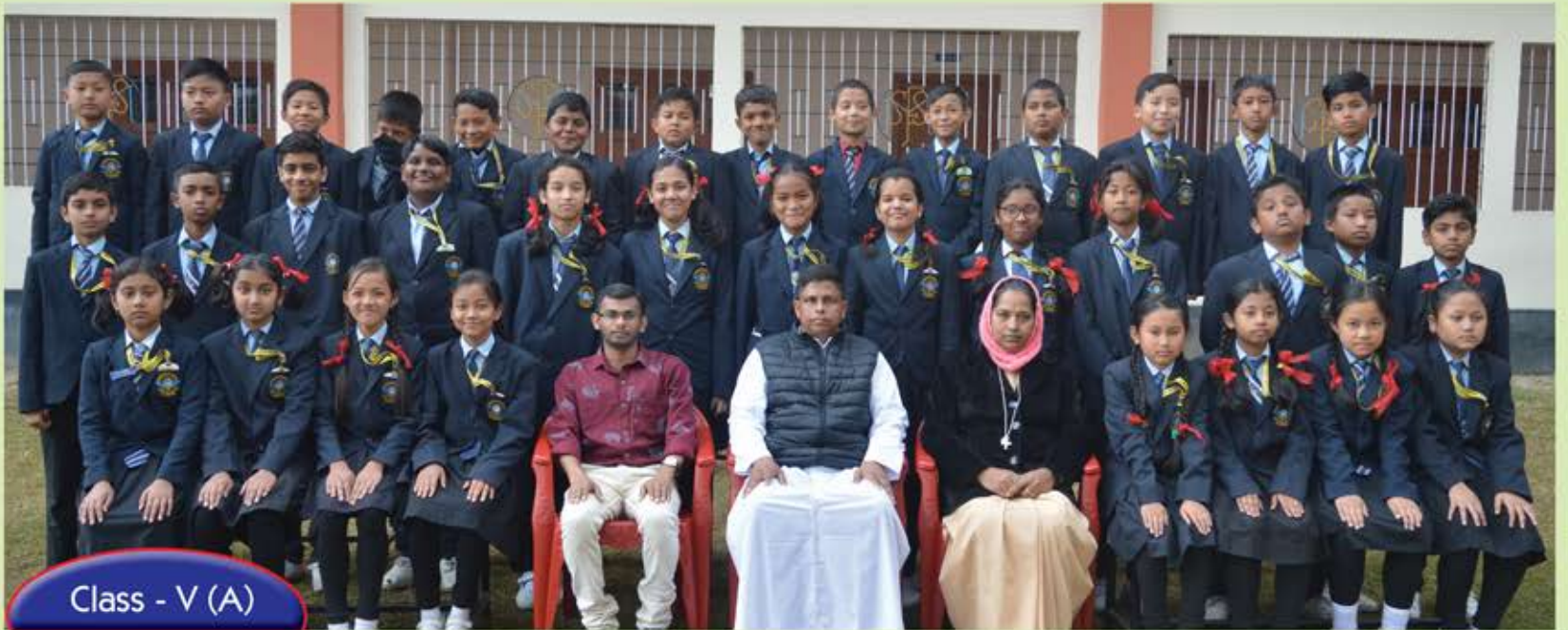
Class - V (A)