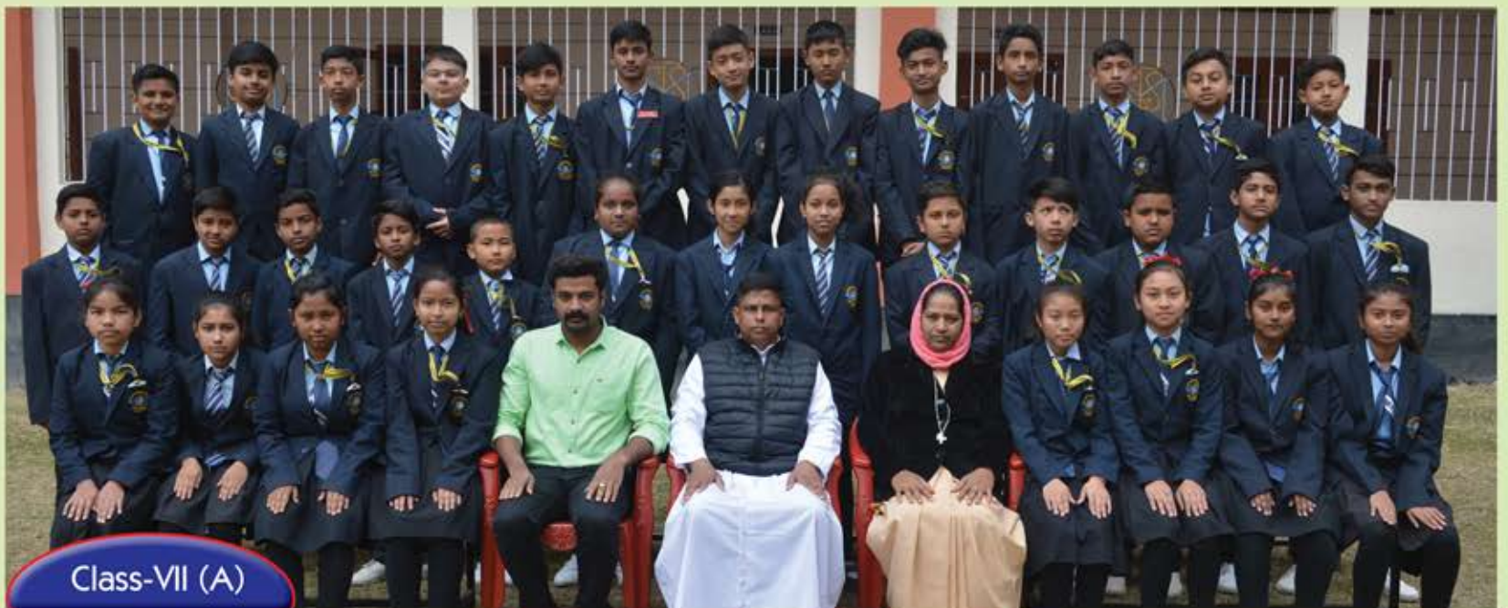
Class - VII (A)