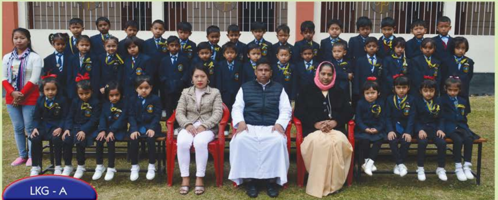
LKG - A