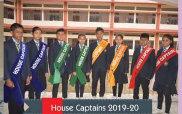
House Captains 2019-20