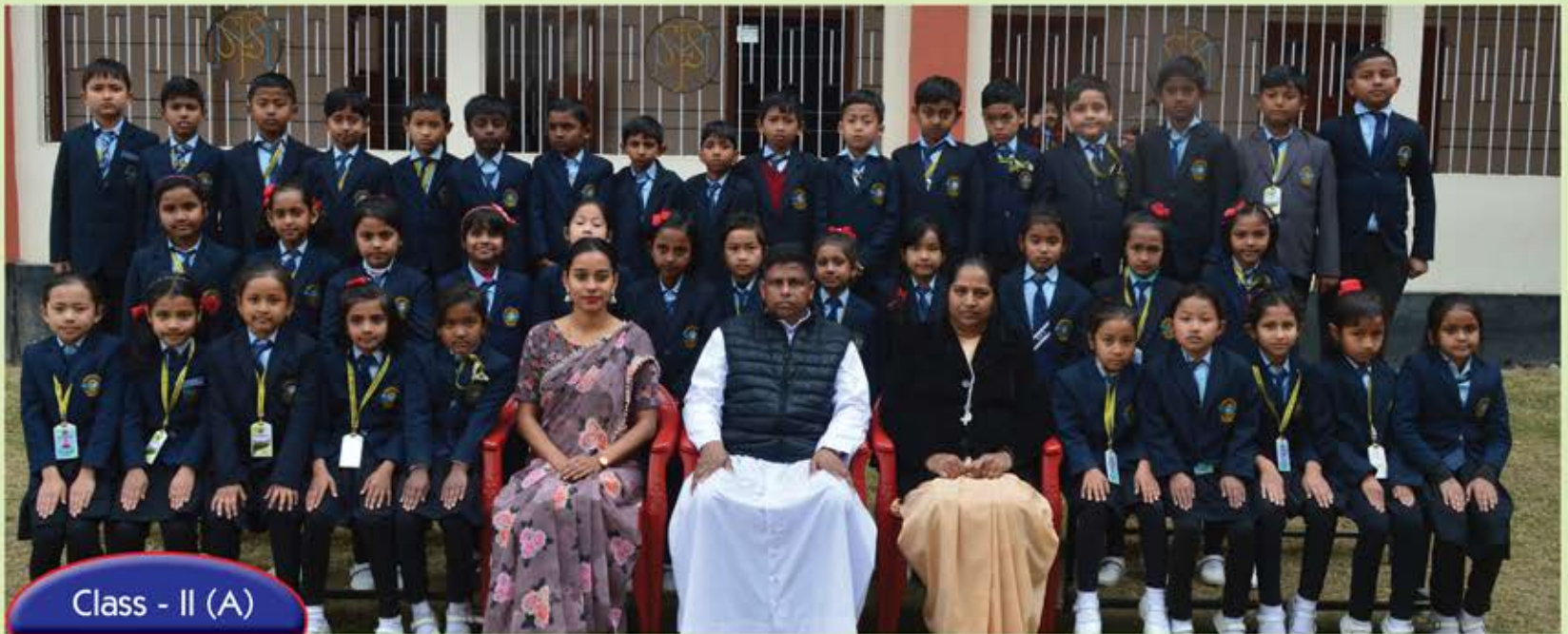
Class - II (A)