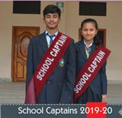
School Captains 2019-20