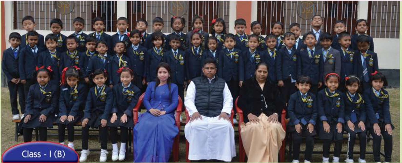
Class - I (B)